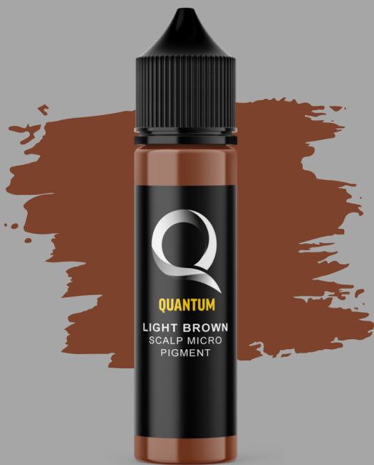
Light Brown SMP

Our Scalp Micro Pigments are ready for use, straight out the bottle! You can use our Mixing Solution to dilute the pigment as needed for a better color coverage or to match a skin tone. Our SMP lasts about 4 - 6 years depending on your customers after care and skin condition.